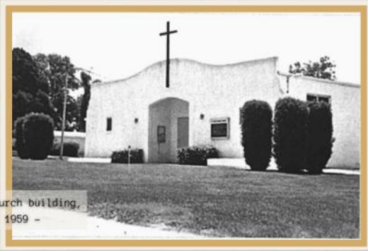
First Church building. - 1959 -

El primer edificio de la parroquia de Santa Ana, donde se celebró la Eucaristía, fue el Edificio P. Anderson.