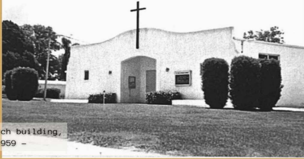
First Church building, - 1959 -

The first building at St. Ann Parish, where the Eucharist was celebrated, was the Fr. Anderson Building.